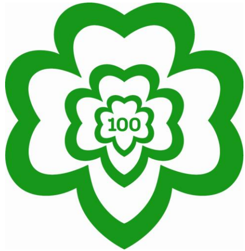
The 100 th Anniversary logo: