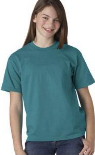
2012 t-shirt color: