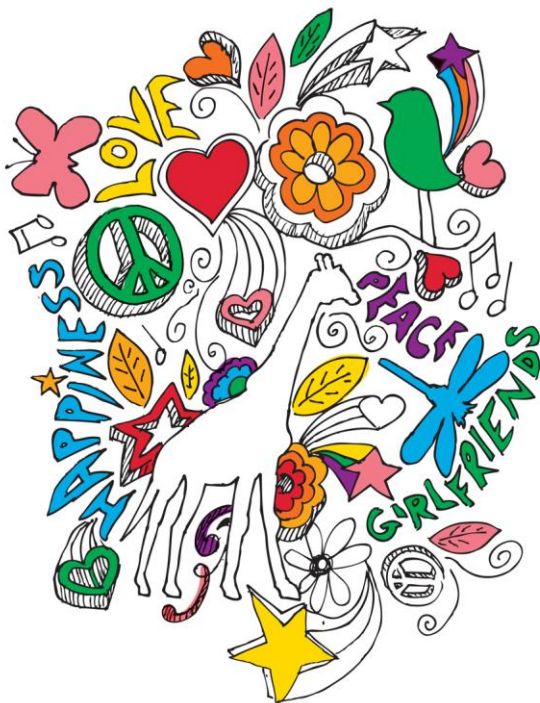
The baker's 2012 theme: